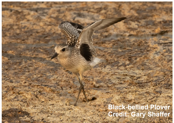
Black-bellied Plover

Western Wood-Pee-wee and Willow Flycatchers are still around and moving through, with a number having been reported during the last couple BCCBS survey rounds. (One of many reasons to join the Bear Creek Community Bird Survey effort! See the RVAS website for information.) These two are very similar and sometimes present an identification challenge when not vocalizing.