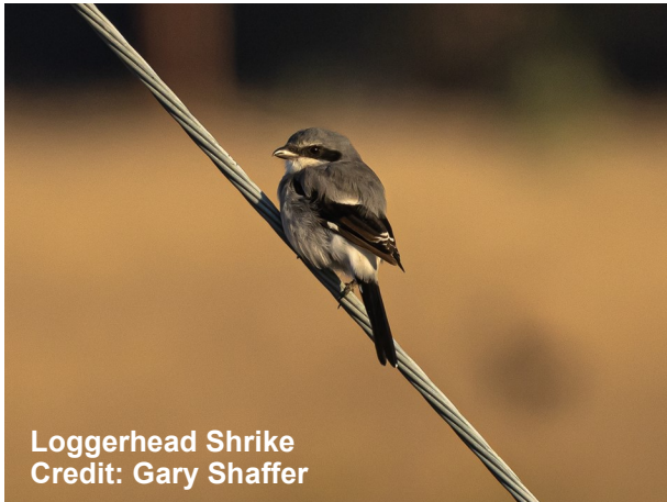
Loggerhead Shrike

A Loggerhead Shrike has been reported out at Kirtland Rd. Ponds on multiple occasions the last few months, with an observation or three of two birds present out there. On Jul. 20 a juvenile Loggerhead Shrike was photographed out at Kirtland (JK) - possibly some local breeders.