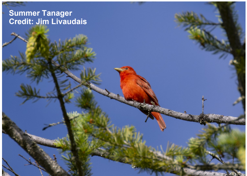
Summer Tanager

All errors and omissions are my own. Peace.