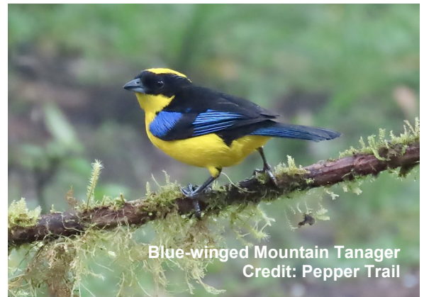
Blue-winged Mountain Tanager